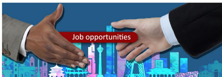
Fig.1.1. Home Page of the Website in English for the TYSP

(ii) In order to know the details, please visit the home page of the website -- a column introducing the program for talented young scientists from developing countries to work in China.